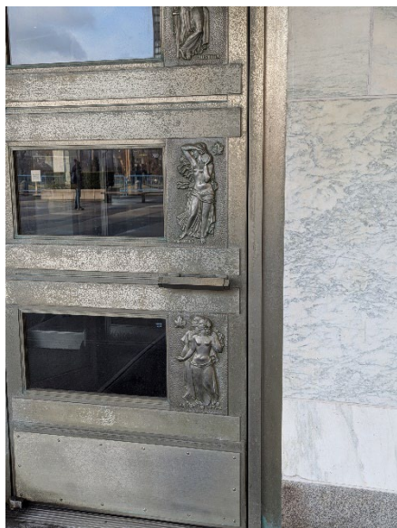
Figure 1 – The doors to the UN

After an emotional week I closed it off with a virtual meeting to connect with Ezanne Swanepoel, a representative from the consultation firm, Intersol, to engage them on UNE's Structural review. It was a productive meeting, and I am excited by the prospect of working with Intersol to undertake the project of the Structural review. A follow up meeting with Ezanne and Ed Cashman will occur in January 2025.