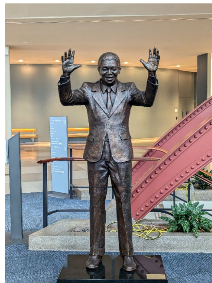
Figure 2 – The welcome statue